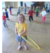
Hoops are fun!