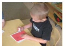
Our preschoolers have jumped right into work doing so many amazing things!