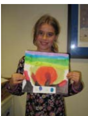
Science is in abundance in Lower Elementary