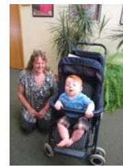
Our infants get outside as much as possible which is especially great during these fall days!