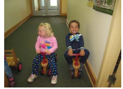
Wet weather doesn't slow us down!