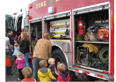
The Hartwick Fire Department stopped by during Fire Prevention Week to speak with the children about fire safety.

We enjoy it when the firemen come to visit and teach us about fire safety. Getting in the truck is cool, too!