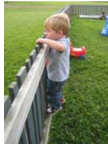
Our Toddlers have been enjoying the beautiful Fall weather!