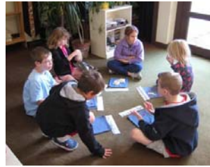
Our Lower EI students talk things over with each other.