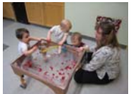
Our infant programs provide activities too. Everyone is busy.