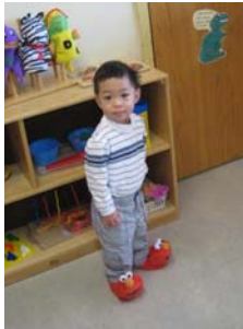
Our Toddlers are always active and having fun.