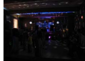
Everybody boogied at the DISCO! It was great fun for all ages.