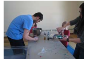
Tye-Dying shirts was messy, but fun!