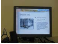
Lower Elementary students share their PowerPoint presentations