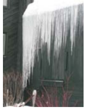
We've had amazing icicles.