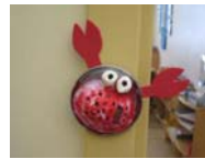
We're not crabby, just our décor is!