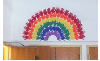
Holly Room's beautiful rainbow design was created by the children in After Care with their traced hands.

Don't forget that April also means Spring Break , which will be six days April 18 - 21 & April 25 . The theme of the week is Space , so be prepared to blast off with excitement!