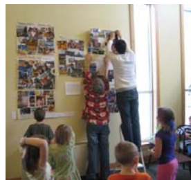
The Lower Elementary students supervise the hanging of their "Basic Needs of Man" posters.