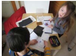
Our Toddlers are so busy learning and experiencing new things.