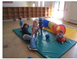
Our Waddlers love to tumble!