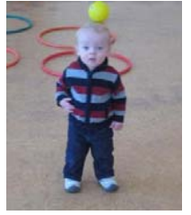
We're always on the move!