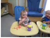
Our Infants love to eat!