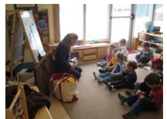
French continues to be a highlight of our days.